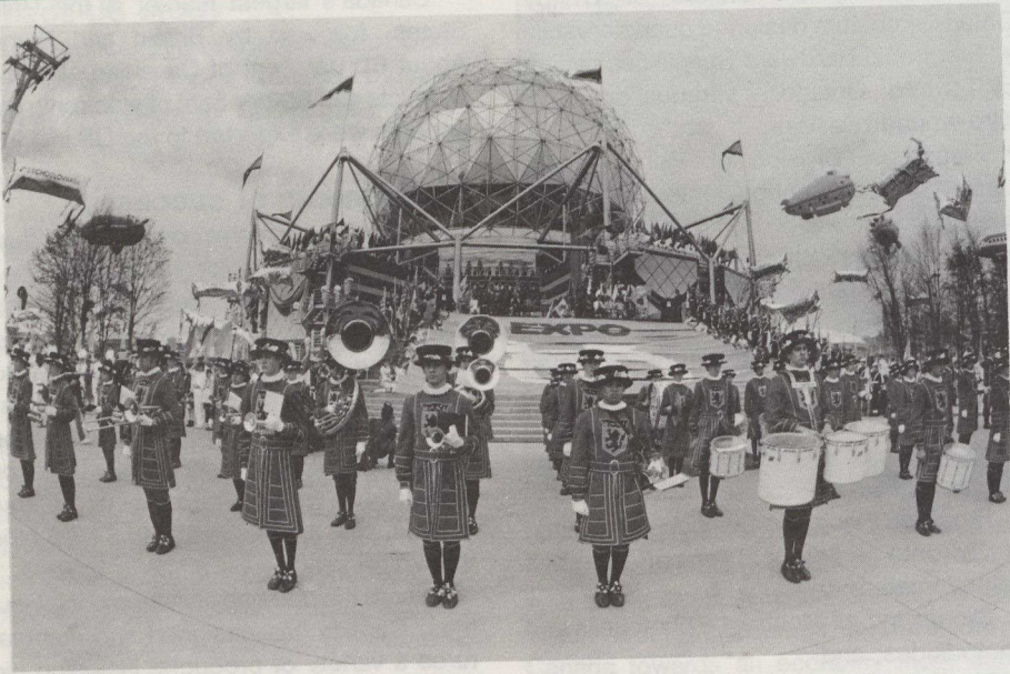
The Beefeater Band joined thousands of performers in the colourful opening ceremony of the Expo Centre, Vancouver, British Columbia, on May 2, 1985.

During its preview opening, May 2 to October 14, 1985, the Expo Centre complex has proved to be a major attraction in Vancouver, and one that has created an enthusiastic awareness of the 1986 World Exposition, EXPO '86, to be held in the city from May 2 to October 13, 1986. With far more than 500 000 visitors to the centre, the attendance was almost double the original estimate of 300 000.