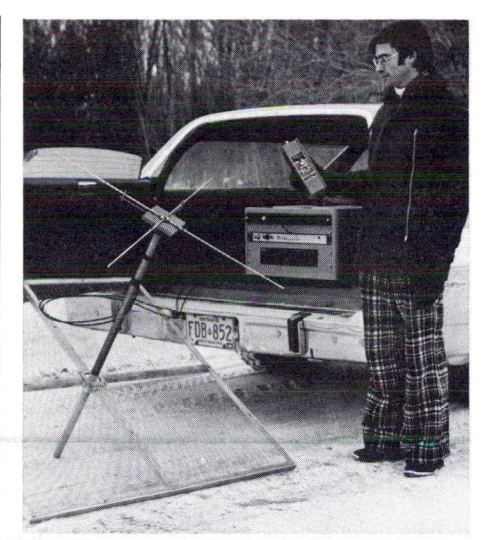
The Emergency Locator Transmitter (ELT) is held by a field researcher.

As soon as the nearest satellite to a crash location appeared over the horizon visible from that site, it would alert ground stations that it had received an alarm. About 15 minutes later, at the conclusion of its pass, an immediate initial "fix" to within about 70 miles accuracy could be obtained. An optimized position, fixing the crash site to within one to five miles, would be delivered in anywhere from two to