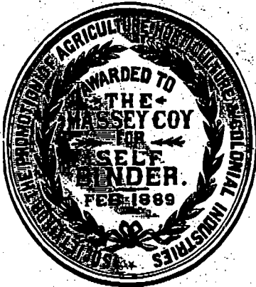
Silver Medal from Cape Colony.