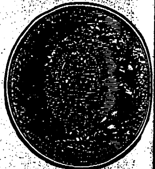
Gold Medal from Melbourne.

GRAND OBJECT OF ART awarded the Massey M'g Co. at the Great Paris Exposition, 1889.