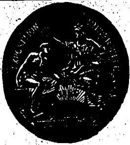
Gold Medal from Paris.