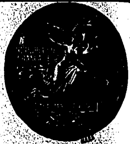
Gold Medal from Paris.