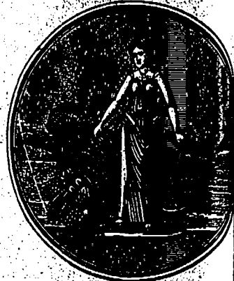
Silver Medal from Cape Colony.