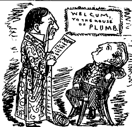
The Post Vindicated.