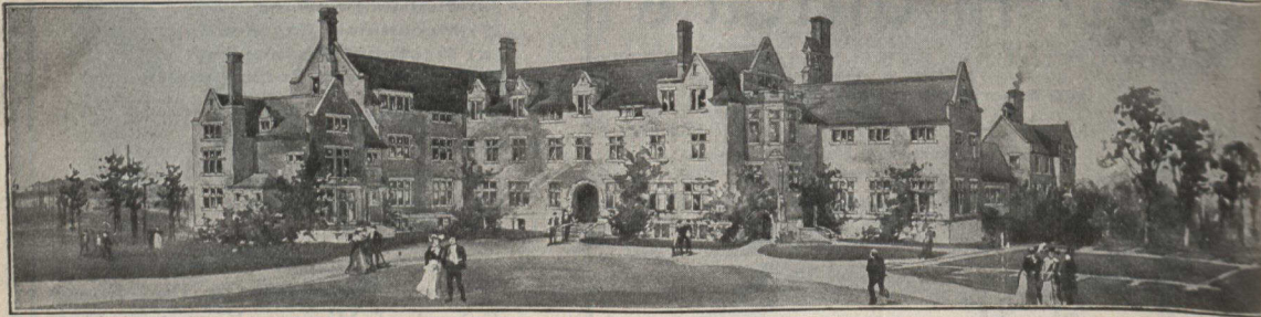
PROPOSED UPPER SCHOOL BUILDING