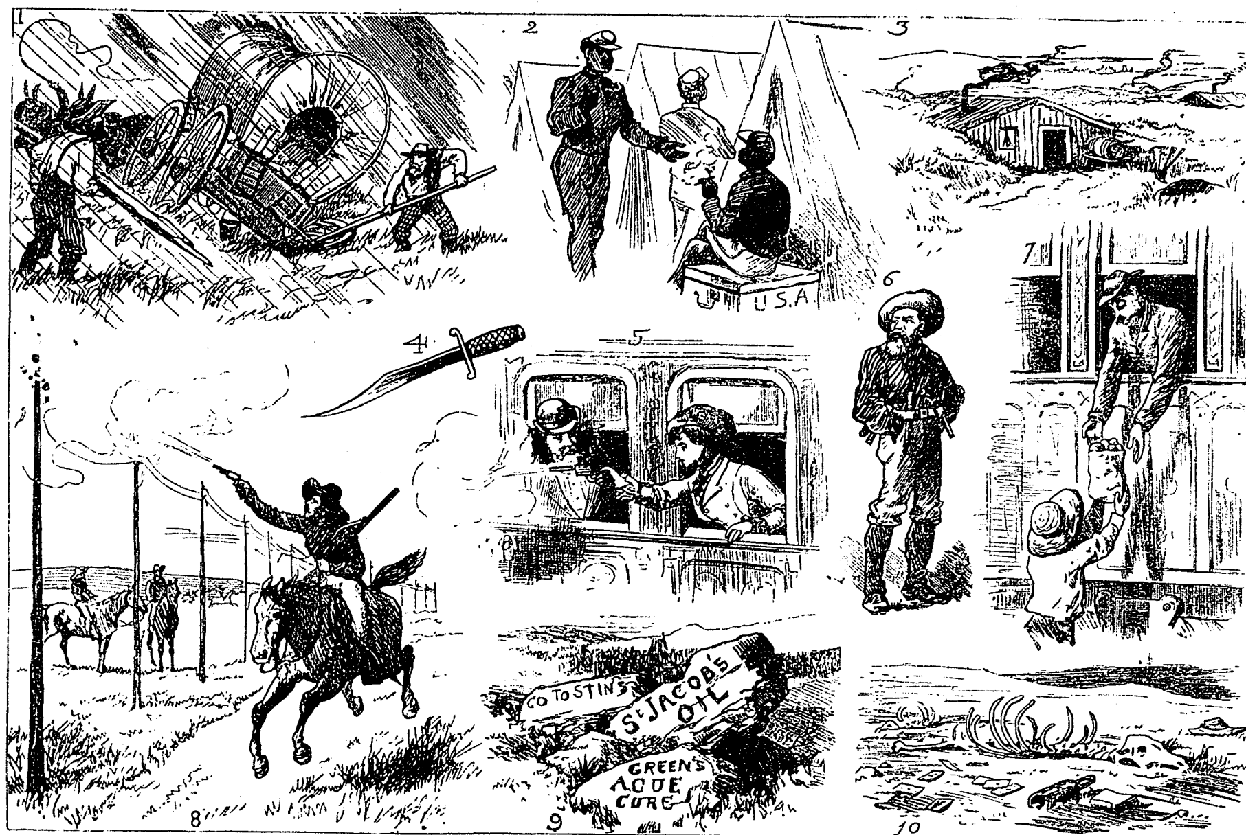
1. A Prairie "Schooner" in a Squall.—2. Buffalo Soldiers.—3. A Colony of "Dug Outs."—4. A Tooth-pick.—5. A Passing Shot.—6. A Gentleman of Arizona.—7. Twenty Oranges for Two "Bits."—8. Cow-Boys Amusing Themselves.—9. Sublime Nature Imposed Upon.—10. A Sequestered Nook in the Desert.