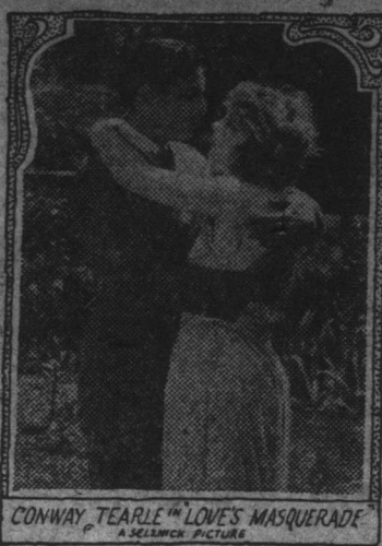
CONWAY TEARLE "LOVE'S MASQUERADE"

League Football—St. George's Field, this evening at 7.30. Saints vs. C.E.I. Admission 10c.; Ladies free; Grandstand 10c. extra. Boys free.—June 15, 11