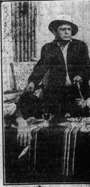
A Heavy Blow Descended!

Quabba is waiting on the bridge. From a bag on the piano cart he hastily draws the panting Luke an old coat, trousers and a hat that has a wig within it.