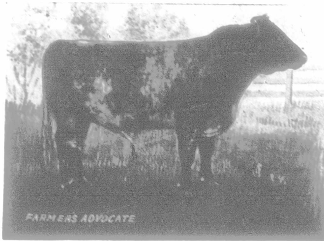
IMP. FASHION'S FAVORITE.