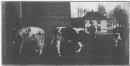
Neat and Attractive, Yet Strong and Serviceable

It is a common observation that comparatively few farmers are awake to the advantages and economic importance of practical, dependable gates for protection and convenience. Their tolerance of the crude, ineffective affairs used as gates argues a want of enterprise and business judgment that in some sections is astonishing. Experiences are common in every agricultural community that should induce stockmen, particularly breeders