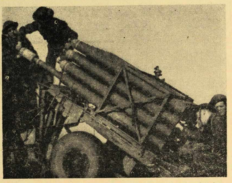
The Second Great War saw tremendous strides in the use of rocket projectiles, and weapons of this type will be studied by the C. O. T. C. during the summer training periods.