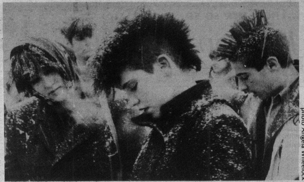
Hyper-punker and two young women in transition.

Gale Garnett and Company is always enjoyable and occasionally fabulous. Probably the most important thing about it is that the production is at all times sincere and not contrived garbage, trying to please. You can't help but like the play as a whole, and you'll definitely love it in places.