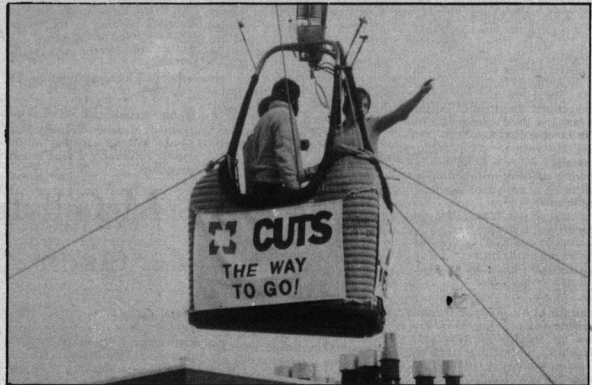
Up, up and away in a beautiful balloon

"We charter planes at certain times of the year when we're expecting a lot of traffic, like flights going to Toronto or Vancouver at Christmas time," says Fowler.