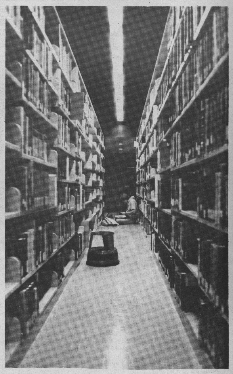
December : . . the month with exams. The study space shortage meant students had to study wherever they could, like this woman in the stacks of Rutherford Library.