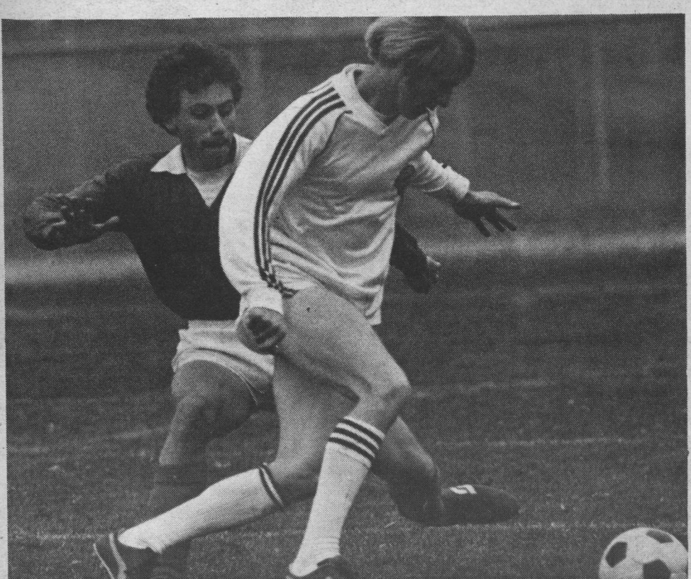
The Bears Soccer Team won the national championship this fall. The Football Team didn't fare as well, but it did win the Western championship.