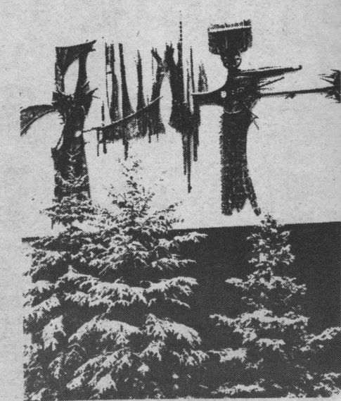
The year's first snowfall.