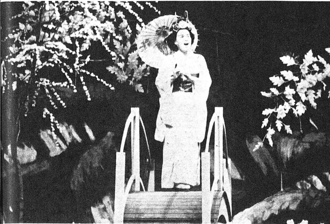
SCENE FROM EDMONTON OPERA SOCIETY'S "MADAME BUTTERFLY"