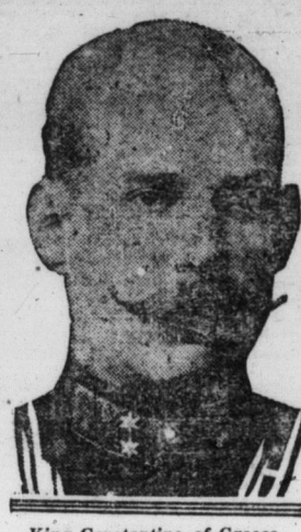
King Constantine, of Greece.

Ever read the above letter? A new one appears from time to time. They are genuine, true, and full of human interest.