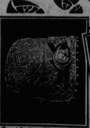
Braided with soutache