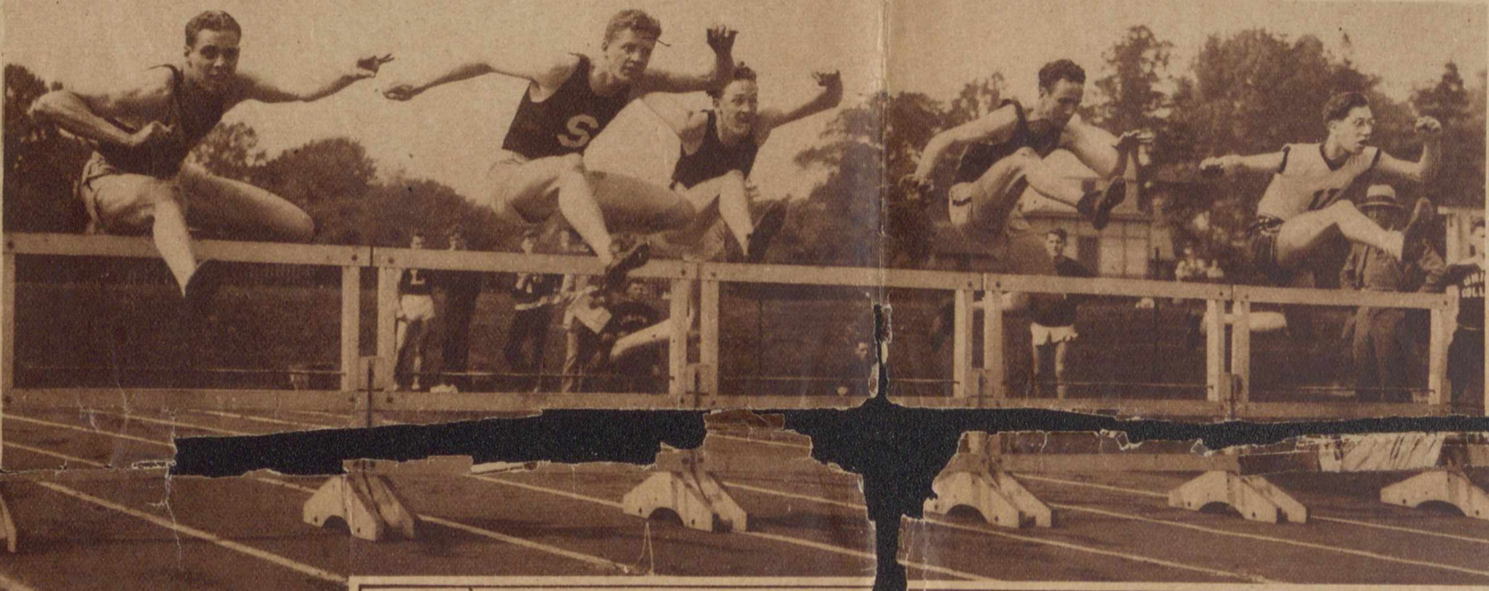
Flyin' High! S'élancant!