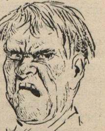
IV. Half-Time. Varsity 24, Argos. 0.