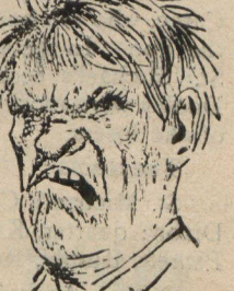
V. Full-Time. Varsity's Nesbitt Cup. Varsity 30, Argos. 5.