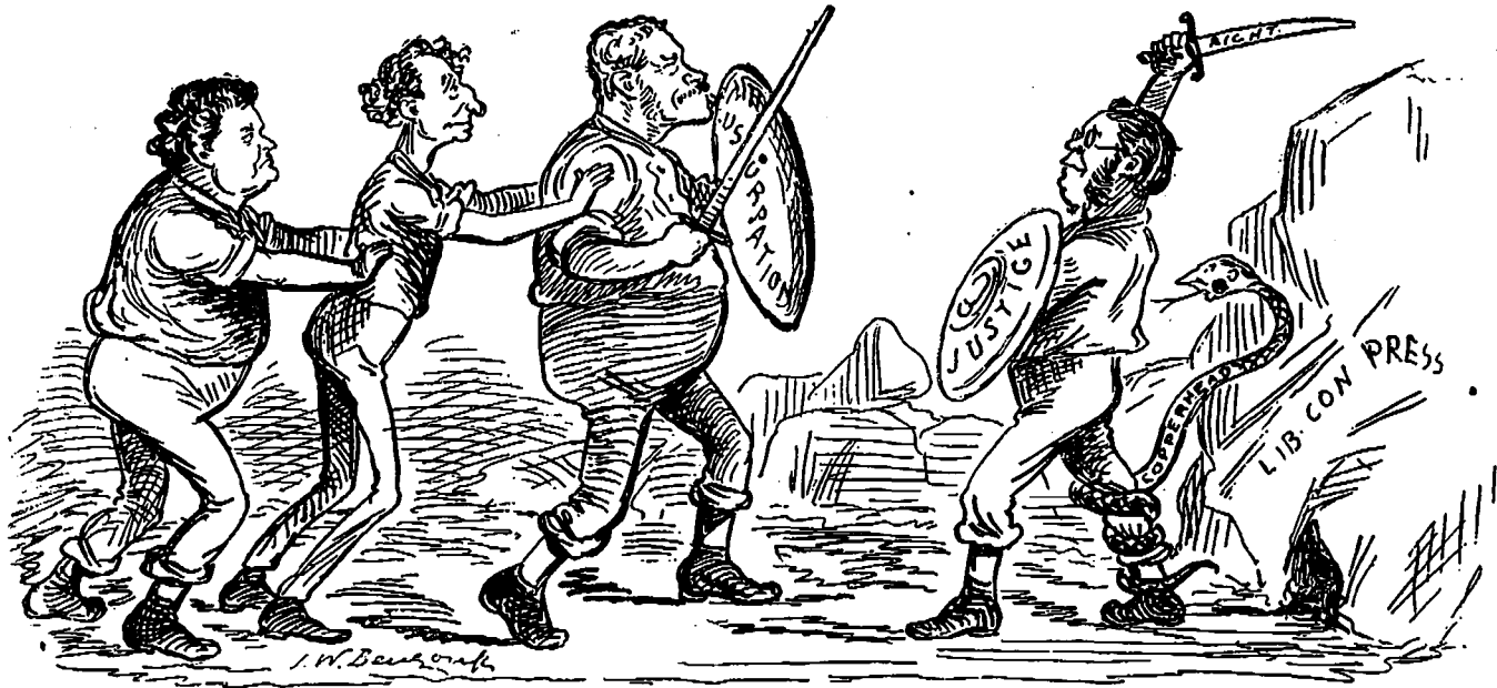
THE SITUATION AT RAT PORTAGE MADE PLAIN.