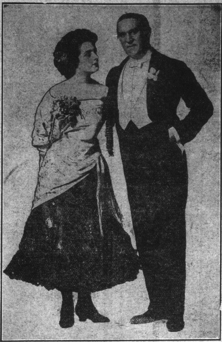
A scene from "Men and Women," which the Chicago Stock Company will present on Monday night.

A telegram from South Branch to-day says that lots of salmon have been seen in the rivers there but none have been caught.