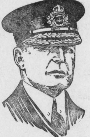
Admiral Sir David Beatty

Realizing the significance and truth of this statement the Citizens' Liberty League appeals to the people of this Province to develop the spirit of comradeship, mutual forbearance, toleration and sympathy. Let us be fair-minded, less rigid, more reasonable, and more willing to give and take.