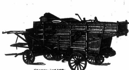
"THE TORONTO ADVANCE," IS THE MOST PERFECT THRESHING MACHINE MADE.

HEADQUARTERS FOR STEAM and HORSE-POWER THRESHING OUTFITS, STRAW-BURNING, PLAIN and TRACTION PORTABLE ENGINES.