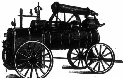
"THE TRIUMPH ENGINE," THE WINNER OF 13 GOLD MEDALS.

THE SIMPLEST. THE STRONGEST. THE LIGHTEST. THE MOST DURABLE ON THE CONTINENT.