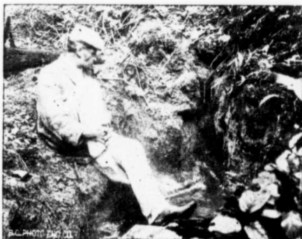
CLEFT IN ROCKS THROUGH WHICH THE SPRING FLOWS.

To those interested in geological phenomena and in the formation of West Coast mineral deposits, there is a valuable lesson to be learned. The mineral deposits of the West Coast are frequently formed along fault planes, and many of the copper deposits are found in rock formations similar to those which form the peninsula. In the fault plane at the end of the promontory, we have actually a mineral lode in process of formation which does not, however, necessarily contain copper.