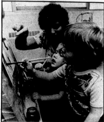
May: An estimated 30 per cent of children starting school in Peel have not been immunized against polio.

The news in July and things were no different in Mississauga as a young Mississauga sprinter was a surprise pick for the Antigua Olympic team.