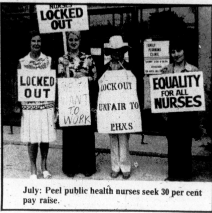
July: Peel public health nurses seek 30 per cent pay raise.

The problems were cleared up and construction began.