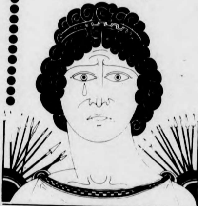
TORONTO ARTS PRODUCTIONS