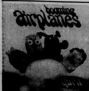
the Rankin Family COLLECTION

Album: Nice, light, and easy to absorb, the Atlantic Canadian band booming airplanes spin forth 12 tunes of traditional-flavoured pop/rock on their major label debut, Yarn . The group, all in their early 20s, have produced a work in which underlying meanings and messages aren't the focal point for this project; mellow-sounding tunes and heartening guitar chords are the true highlights to this album's progress. From the brisk upbeat single "Silver Lining" to the foreboding sounds of "Undone," the band produces music and lyrics that help them rise above the status of a mere bar band. With elements of The Skydiggers, The Grapes of Wrath and Sloan appearing throughout the album, the booming airplanes should fare well with fans of the genre.