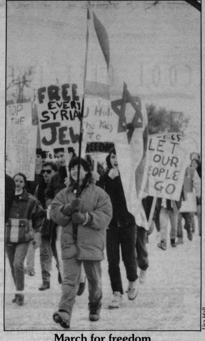
March for freedom

There is a certain prevailing ambivalence about providing for the advancement of gifted kids. The field is gradually opening up, but there is still a long way to go in understanding the needs and wants of bright children while guiding them toward productive adulthood.