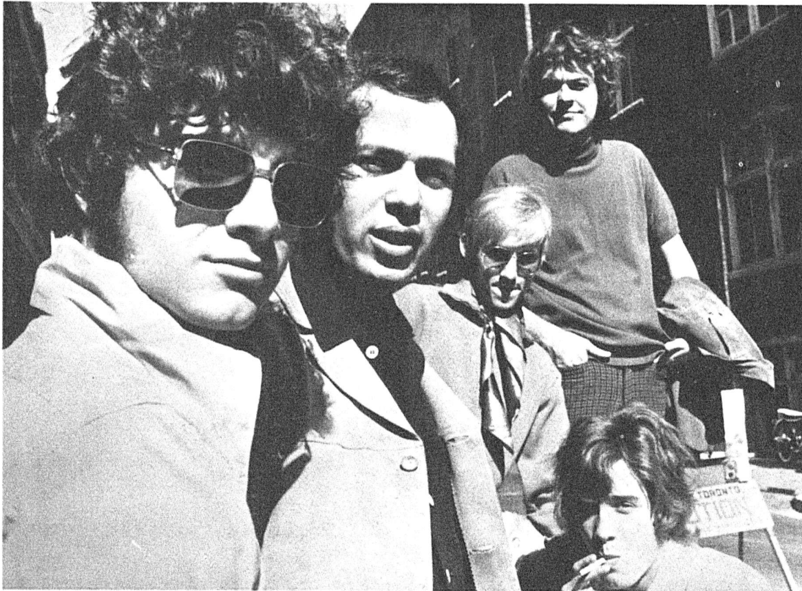
FIVE SOULS FOR SHARE —The Mandala, a group which sings a lot of soul, will appear Oct. 12 at the University Ice Arena. All proceeds of the show will be donated to SHARE. Tickets are $1.50 each. Also to appear on the show will be The Privilege and The Purple Haze.