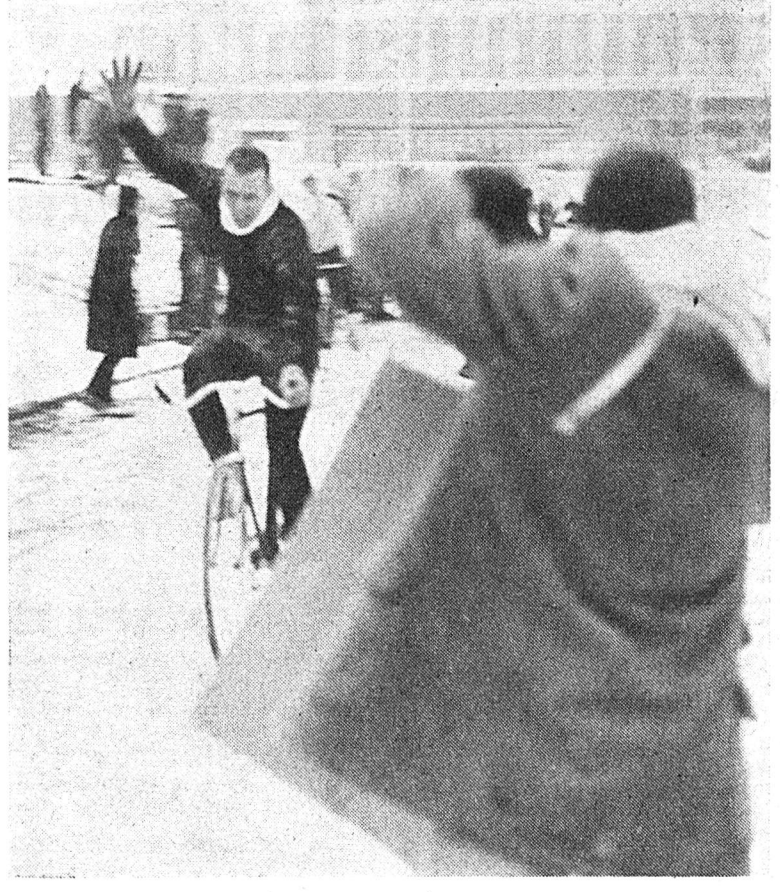
FLYING PAST THE FLAGMAN, a member of physical education's team completes Saturday's intramural cycle drag -25 miles around the varsity grid—in one hour and 30 minutes. Delta Kappa Epsilon placed second, Latter Day Saints, third, and Athabasca Hall, fourth.

NOTE:-You are not restricted to your square draw