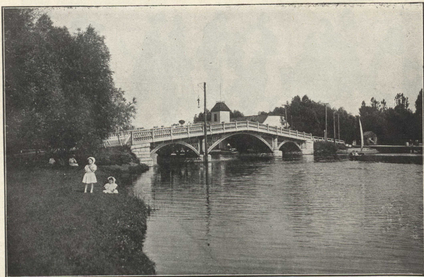
Bridge Crossing Lagoon, Island Park.