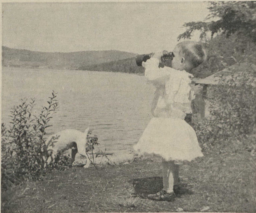
A Small Maid of Quebec.