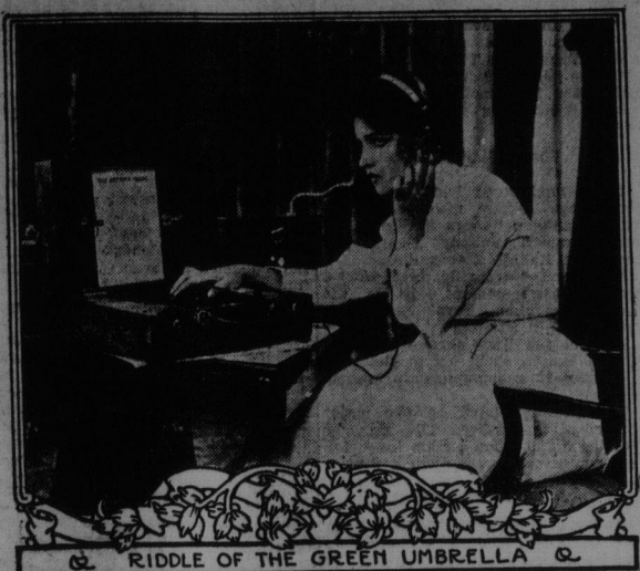
RIDDLE OF THE GREEN UMBRELLA