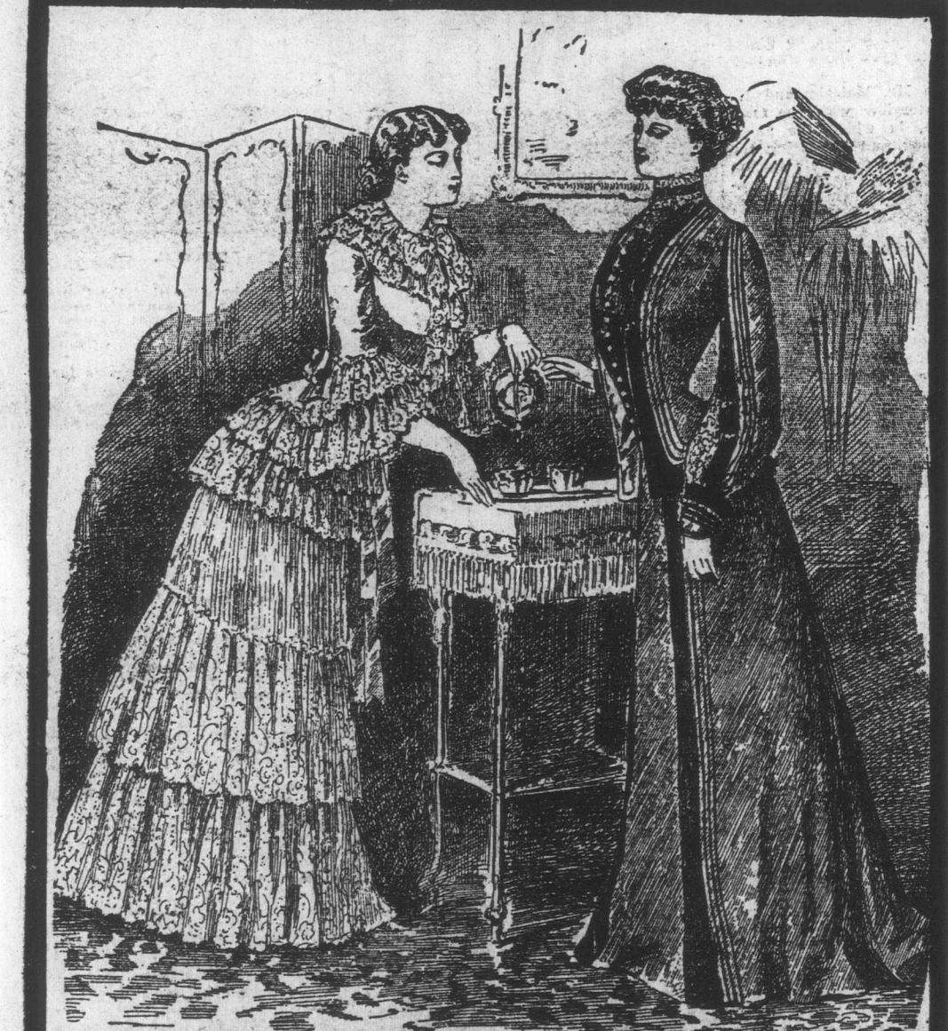
THE SAME DRESSES AS CARRIED OUT IN THE MODERN STYLE