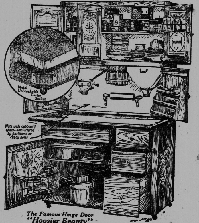
The Famous Hinge Door "Hoosier Beauty"

Easy Terms—Only a Limited Number to be Sold