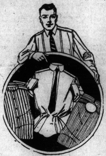
—Main Floor, Centre.

Men's and Boys' Collars, in stand-up-turn-down; close-fitting front, with round and cut-away corners; very straight band and low, lay-down styles. They are in different depths. Sizes 12 to 18 1/2. Each .12 1/2