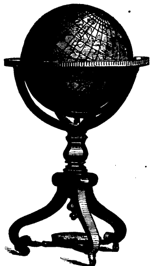
GLOBE WITH HIGH WALNUT STAND.