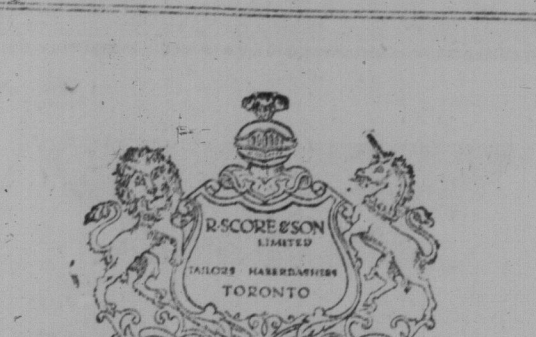
The House that Quality Built

<section-header><text><text><text><text><text><text>