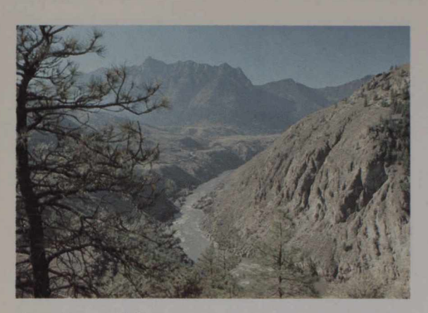
Fraser Canyon, B.C.

The Fraser River skirts the Cariboos in the north and then plunges down its center, deep into rocky canyons, 1,000 or more feet below the plateaus of rich alluvial soil.