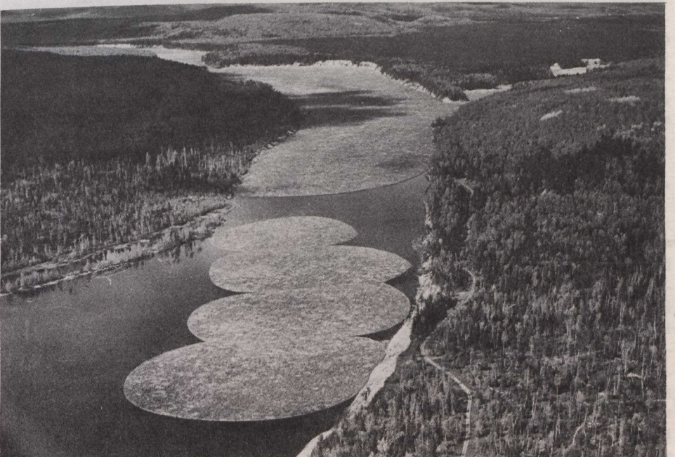
Log booms on the Gatineau River near Ottawa, on their way to the sawmill.

In forest management, the Federal Government is now spending about $43 million a year through agreements with Newfoundland, Nova Scotia, New Brunswick, Quebec and Ontario. This is expected to rise in the next fiscal year as a result of the budgetary re-allocations an-