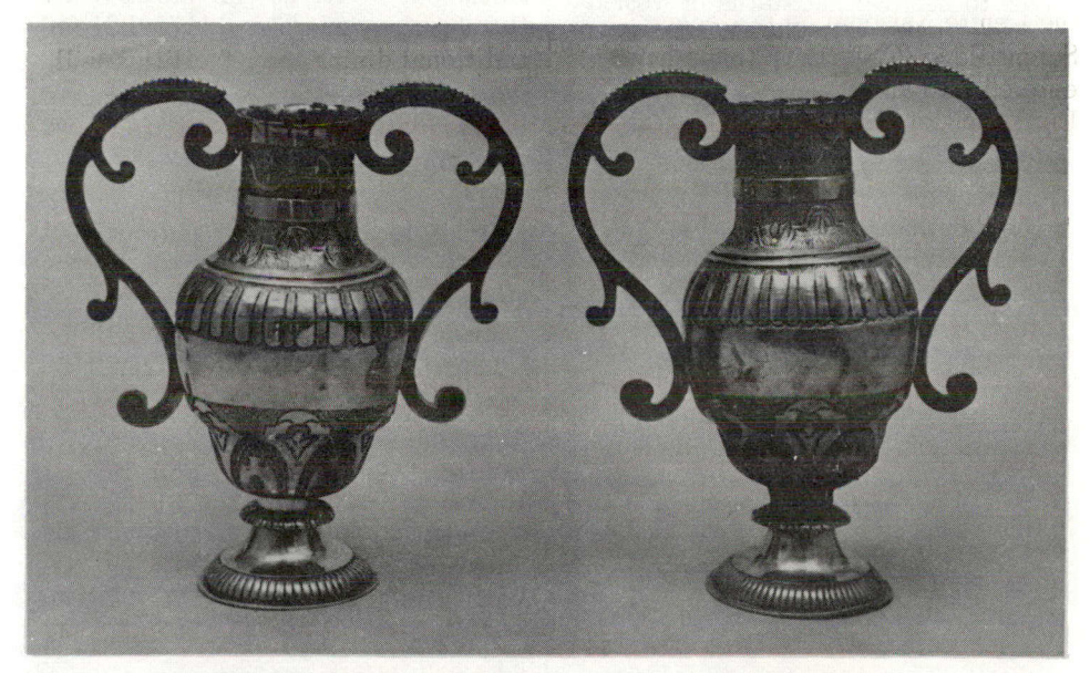
Flower vases (Paul Lambert dit Saint-Paul, Quebec, about 1735.)

Silver in New France is the first exhibition of this type in Canada; the majority of works come from public and private collections in Quebec.