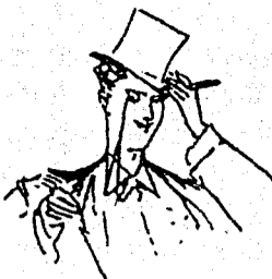
BOW TO A PRETTY WOMAN.