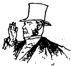
BOW TO THE MASTER OF THE HOUSE.