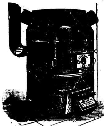
The "Economy" Warm Air Furnace.

J. F. PEASE Furnace Company, 191 Queen St. East, Toronto.