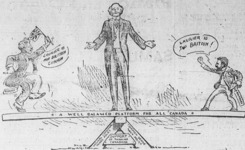
WHERE LAURIER STANDS

South Watrous, Sask. to be a Tourist Mecca