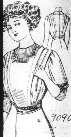
Waist With Square Yoke Effect.

design may form part of an or dinner gown if made with silk and loose sleeves, or finished with a wide lace collar. It is suitable for silk, velvet, cloth or wash. The pattern is cut in 6 sizes: 35, 38, 40 and 42 inches bust. It requires 2 1/2 yards of 27 inch material for the waist for the 36 size and 1 1/2 yards for the tucker. Pattern of this illustration mailed on receipt of 10 c. in stamps.