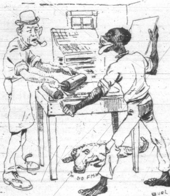
"SOME OF DESE WHITE FOLKS IS H— FO' FISH."