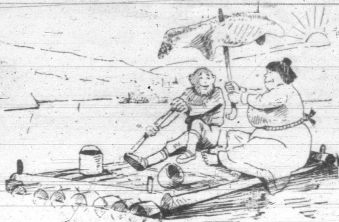
"LIMPIN' GROUSE HELD A PASOL OVER ME."