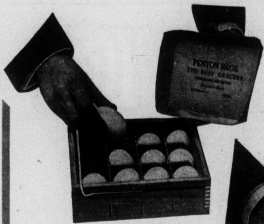
Filled in 9 Seconds—No Miscounts —Your Ad is on Each Tray