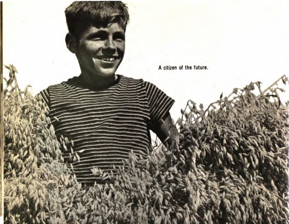
A citizen of the future.

camp of Europe. In the settlement of displaced persons, Canada has taken an important part; some 87,000 people had been received up to November, 1949. Today, people of Ukrainian, Scandinavian, German, Dutch, and Polish origin make up nearly one-fifth of the Canadian population. They are concentrated mainly in the Prairie Provinces. Although quick to adopt Canadian habits, members of this group also retain much of their cultural heritage: in Winnipeg, the capital of Manitoba, newspapers are published in 23 different languages.