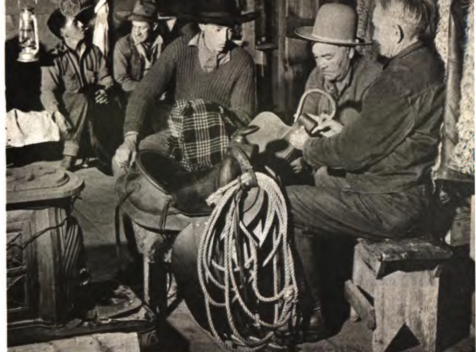
Cow-boys repair a saddle in the bunkhouse of a British Columbia ranch.

Numerous other faiths, including Jewish, Greek-Orthodox,