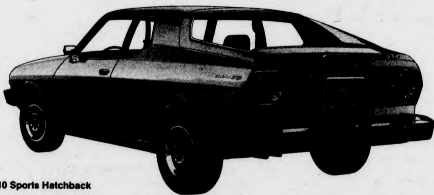
F-10 Sports Hatchback