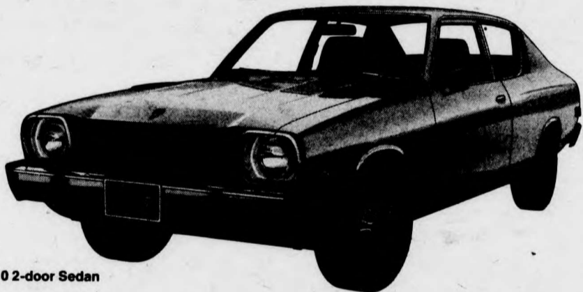
F-10 2-door Sedan