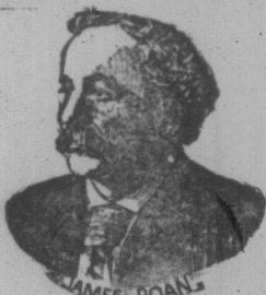
THE ORIGINATOR OF

Wedding Invitations, Announcements, etc., a specialty.